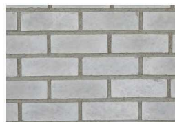
Selkirk - Contemporary Brick Bisque