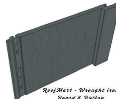
RoofMart - Wrought iron Board & Batten