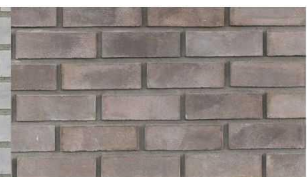
Selkirk - Contemporary Brick Brownstone