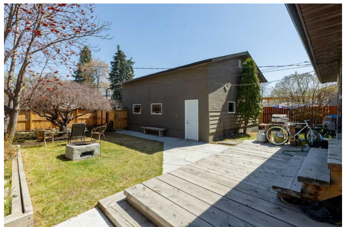
7032 22a St SE, Calgary, AB