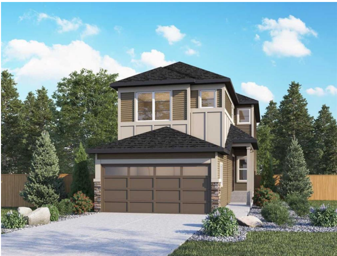
60 Fireside Common

Welcome to the Capri by Genesis Builder Group – a stunning two-story home designed for modern living. This spacious 4-bedroom, 3-bathroom layout features an open-concept main floor with a stylish kitchen island, elegant railing details, and a cozy fireplace with a mantle as the living room centerpiece. Thoughtfully designed for flexibility, the main floor includes a full bedroom and bath, perfect for guests.. Upstairs, you’ll find a bright bonus room, convenient laundry area, and additional bedrooms. Enjoy a double attached garage, 9-foot ceilings in the basement, side entry, and rough-ins ready for potential future basement development – offering endless potential to make this home truly yours. Photos are representative.