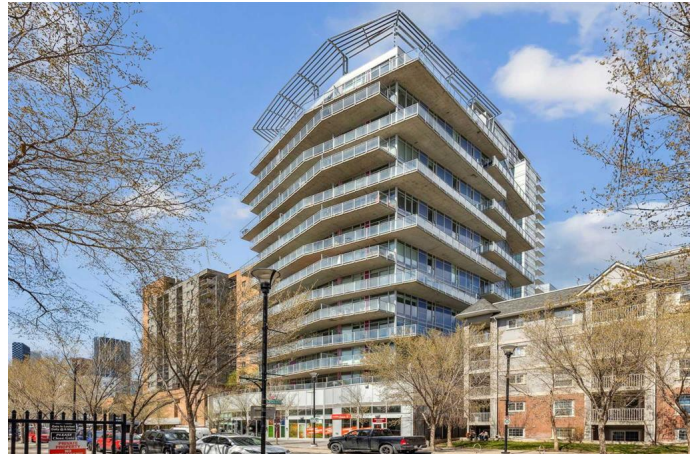
506 624 8 Ave SE - 04/17/2025 Main - 648.16 sq.ft/ 60.21 m2 RMS Area - 648.16 sq.ft/ 60.21 m2