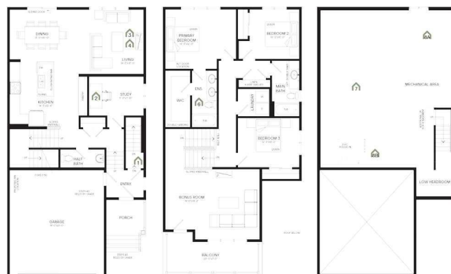
Main floor 888 sq ft. Upper floor 1182 sq ft. Basement (undeveloped)